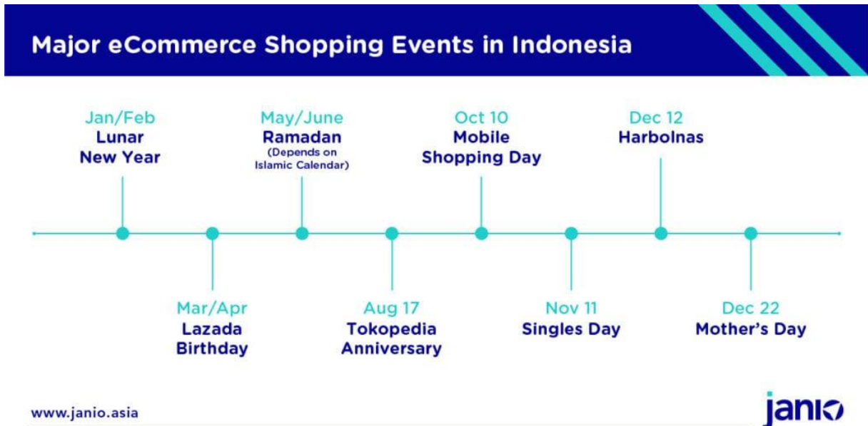
Figure 4. Major eCommerce Shopping Event in Indonesian.

phenomenon worldwide, making its way into consumers' shopping calendars and changing the retail landscape as we know it [6]. Figure 4.