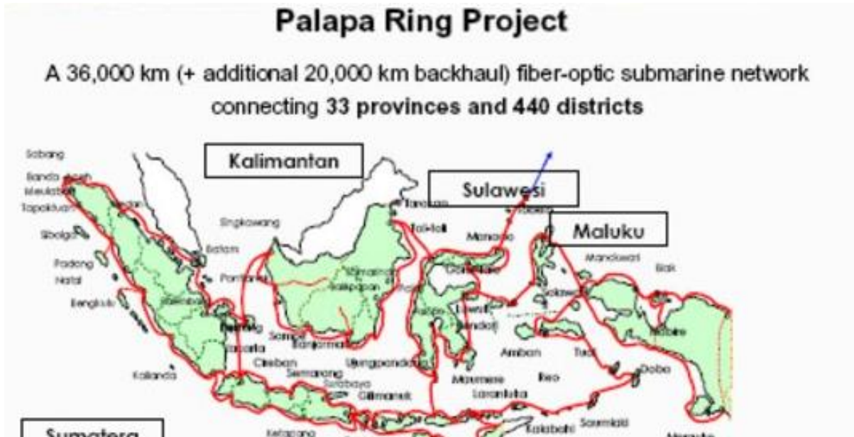
Figure 1. Palapa ring (ICT Whitepaper Indonesia 2012, Loc.Cit).

targeted to connect all major regions in Indonesia. This is expected to encourage the use of the internet in Indonesia, on the positive side of course.